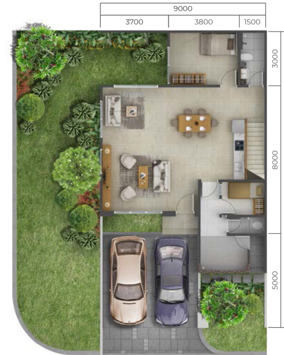
1 st Floor - Alternative