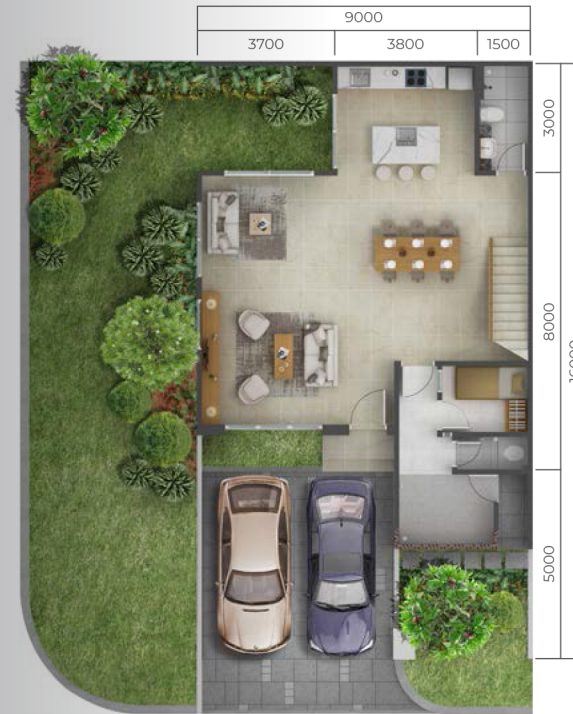
1 st Floor - Standard