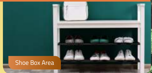
Shoe Box Area