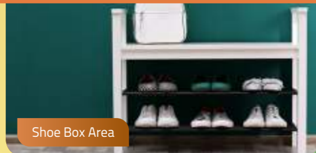
Shoe Box Area