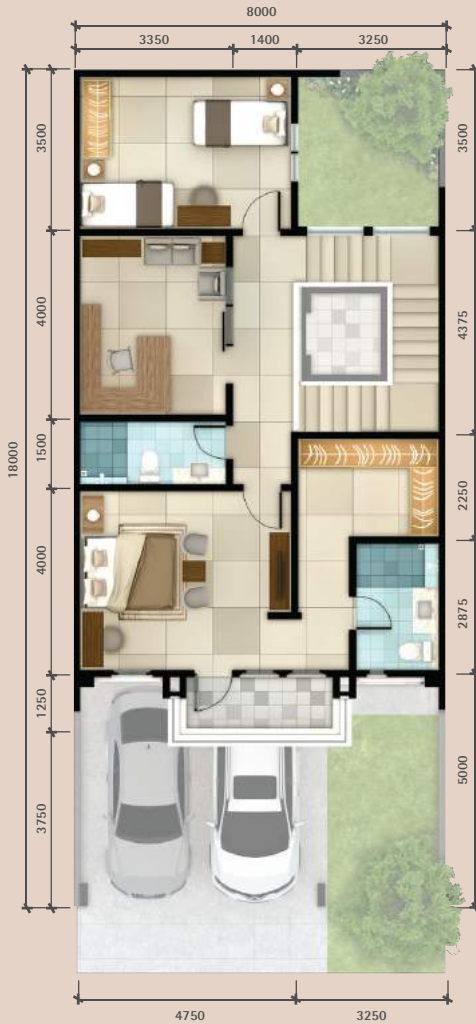
3 rd FLOOR