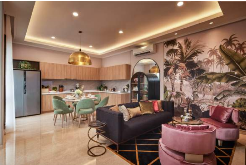
Kitchen Set TOTO