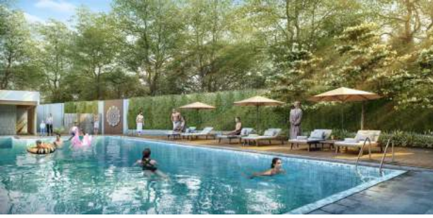
Swimming Pool ▲