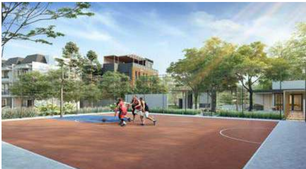
Half Basketball Court ▲