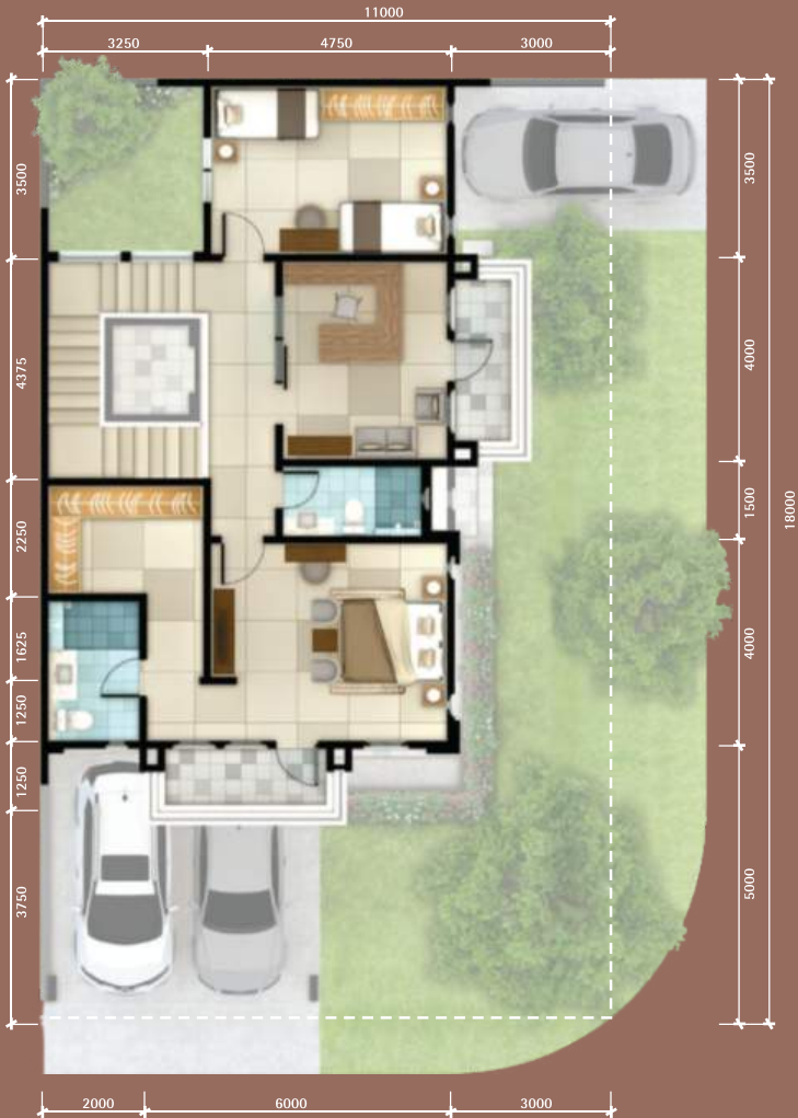
3 rd FLOOR