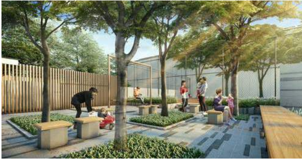
▲ Sport Lounge Playground