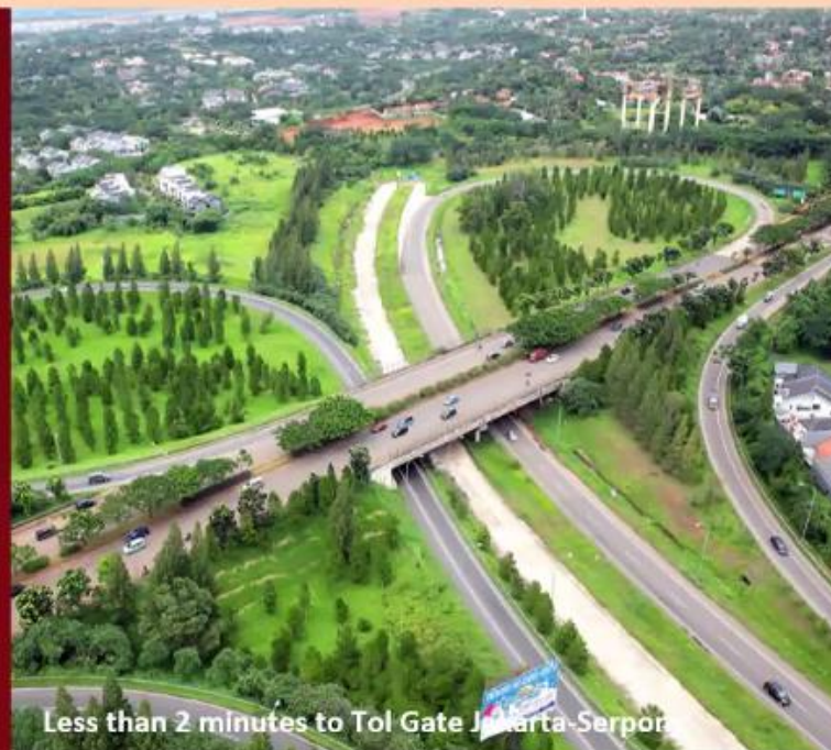
Less than 2 minutes to Tol Gate Jakarta-Serpong