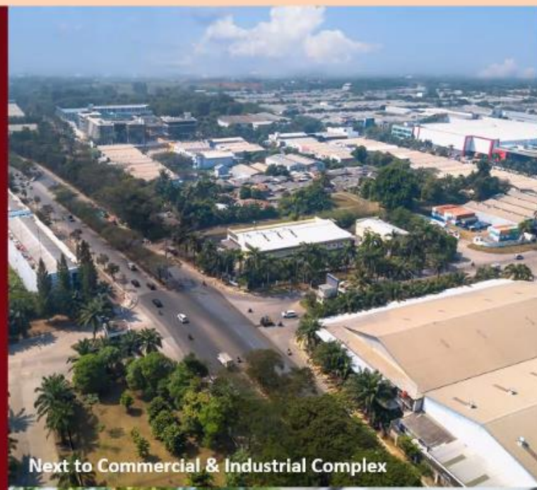
Next to Commercial & Industrial Complex