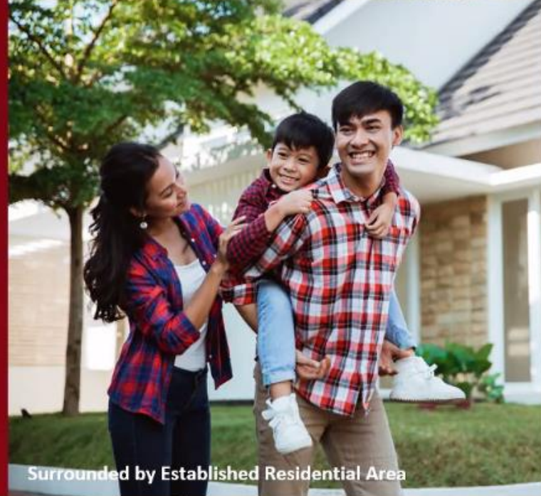
Surrounded by Established Residential Area