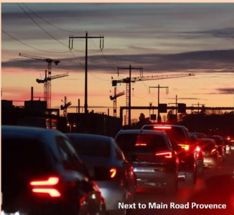
Next to Main Road Provence

Your chance is NOW to have a business space that is close to main road provence Jl. Raya Rawa Buntu. Located in the exit of De Latinos residential area, surrounded by many other established residential as well as commercials, leisure (Taman Kota 2) and industrial area (Taman Tekno). The area also boasts a diverse mix of automotive workshops, eateries, patisseries and gastro pubs that attracts people from outside BSD City to comes in.