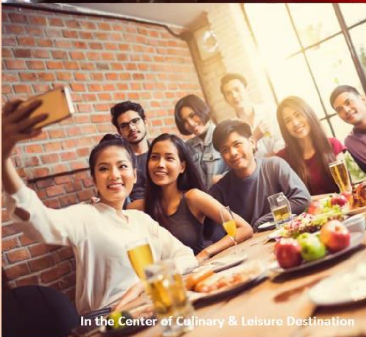
In the Center of Culinary & Leisure Destination