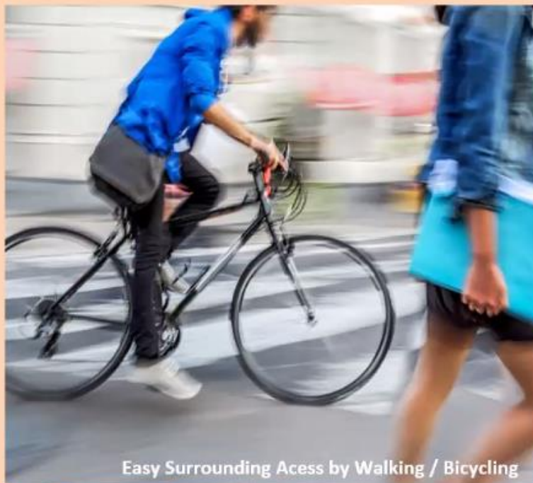
Easy Surrounding Access by Walking / Bicycling

Latinos Business District benefits from multiple public transport links as well as an extensive road network. Within easy reach of Train Station Rawa Buntu and Gate Toll Jakarta-Serpong. Short journey to central Jakarta can be reached only by minutes, and took approximately 30 minutes to Soekarna Hatta Airport. And for a short walk away, there is culinary treasure to be discovered in all directions.