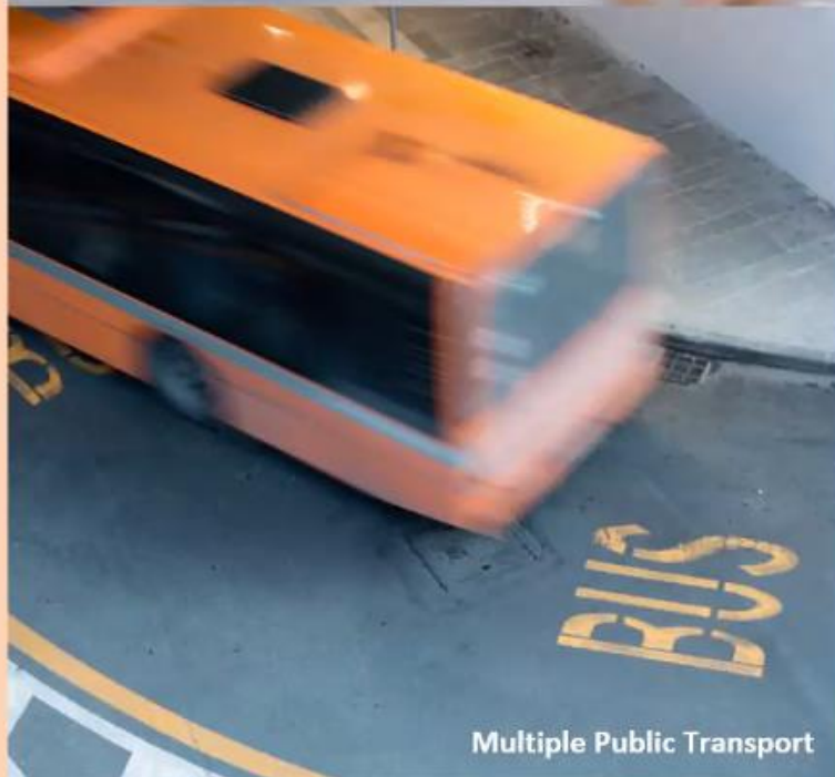
Multiple Public Transport