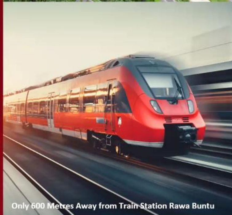
Only 600 Metres Away from Train Station Rawa Buntu