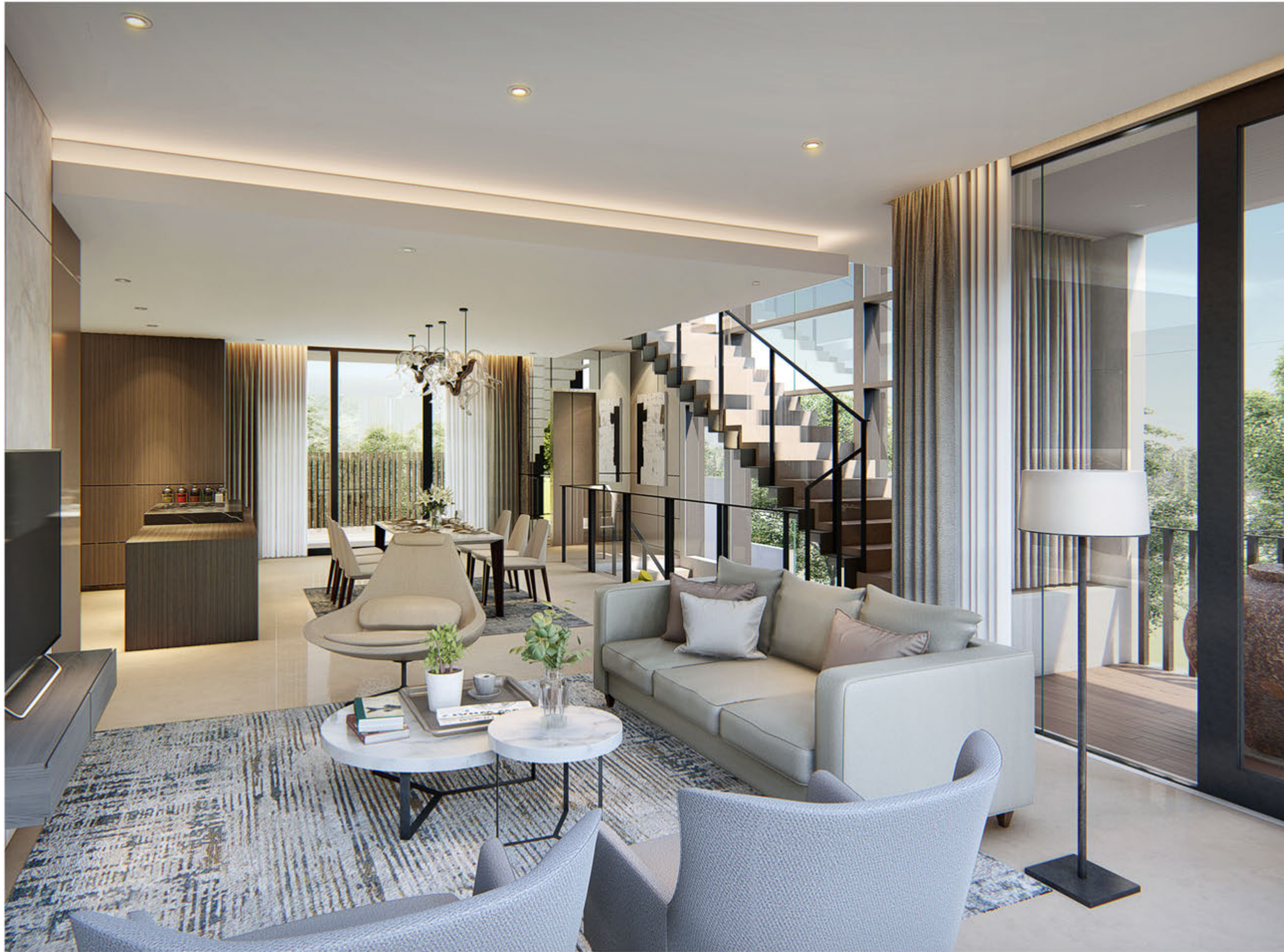
A COZY LIVING ROOM