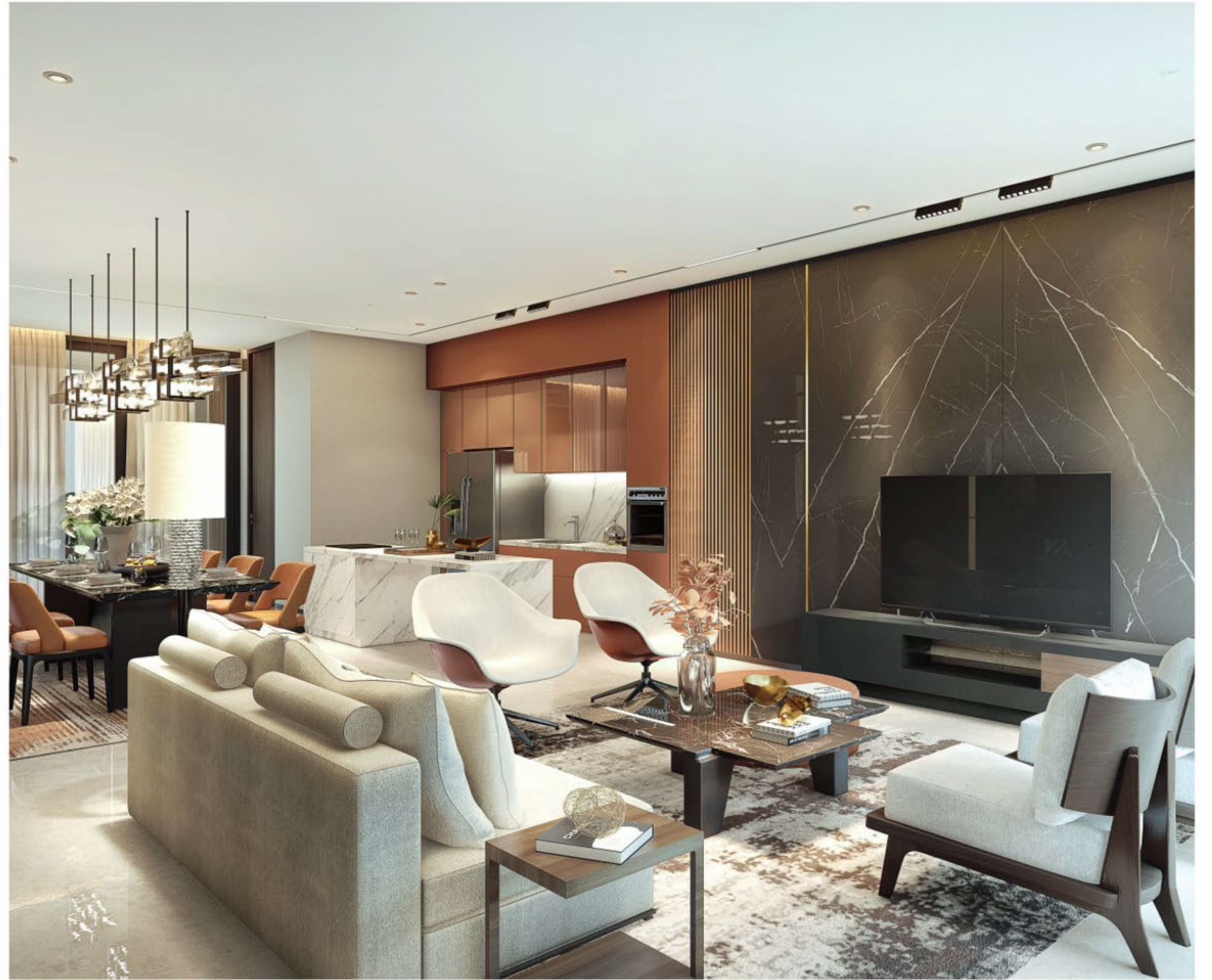
CHIC LIVING ROOM