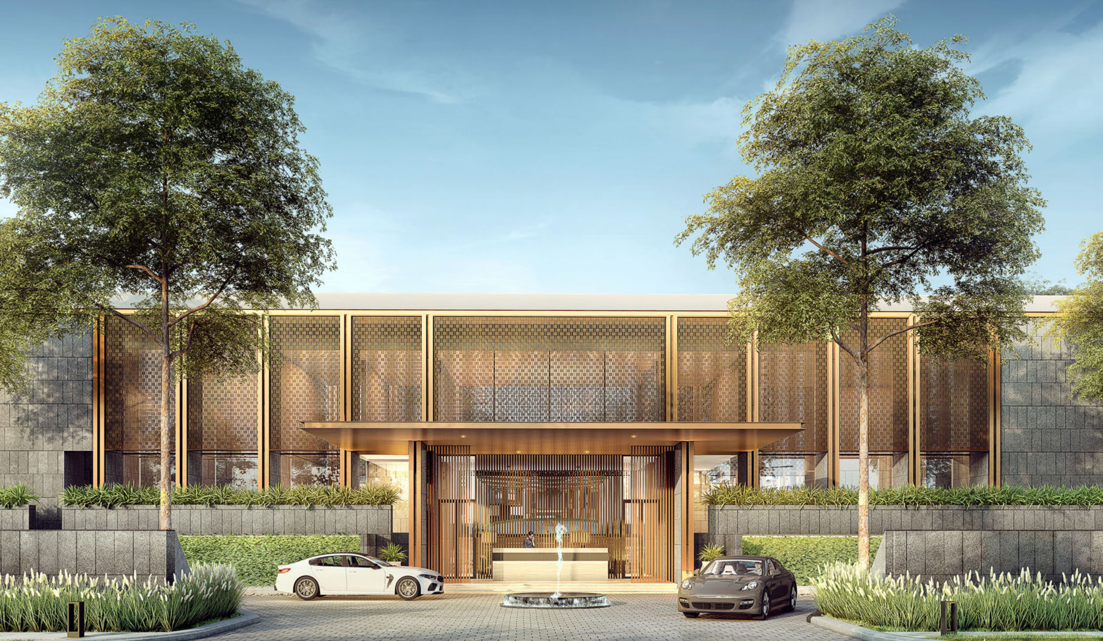
FACILITATED WITH A RESORT-LIKE CLUBHOUSE