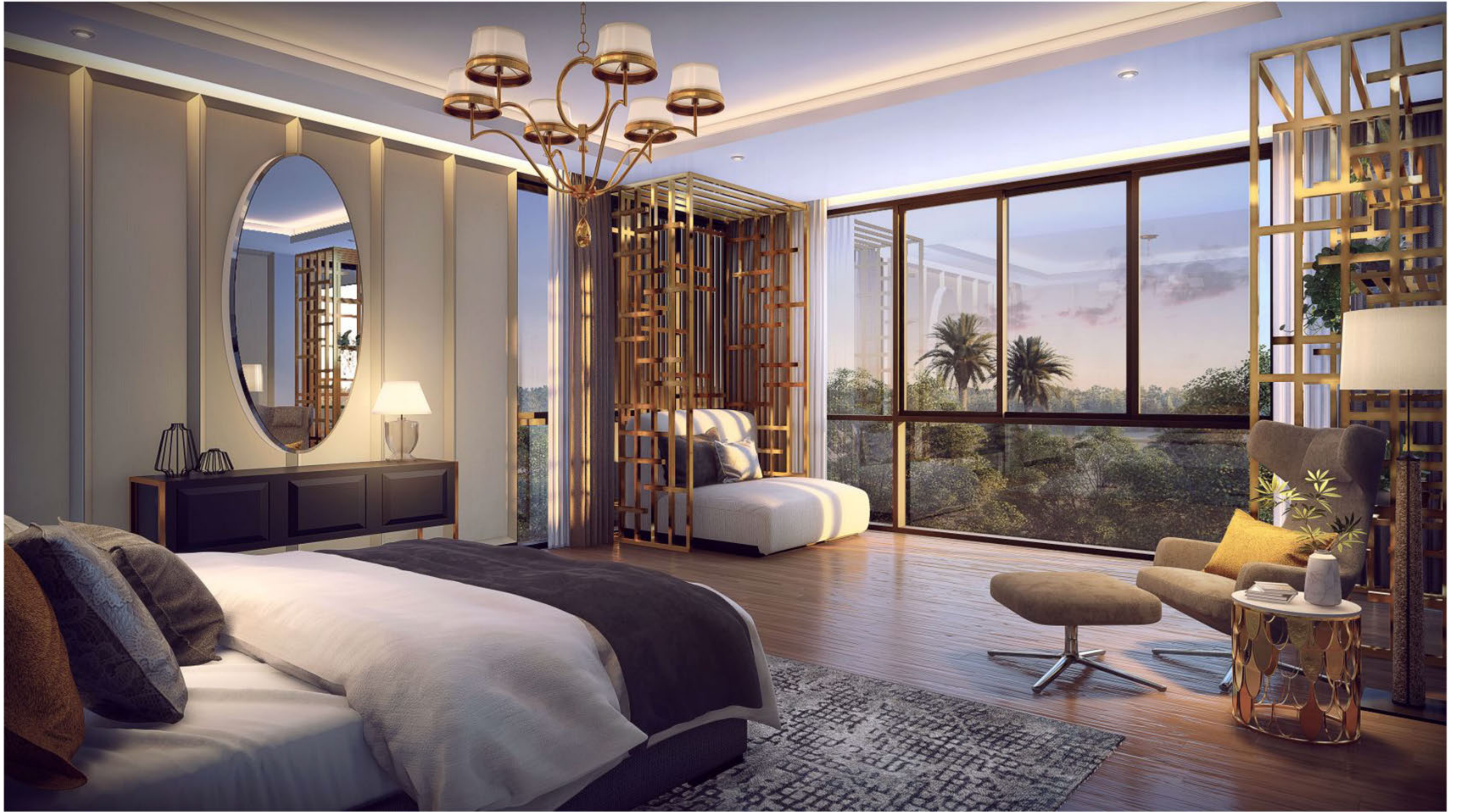
OPULENT MASTER BEDROOM